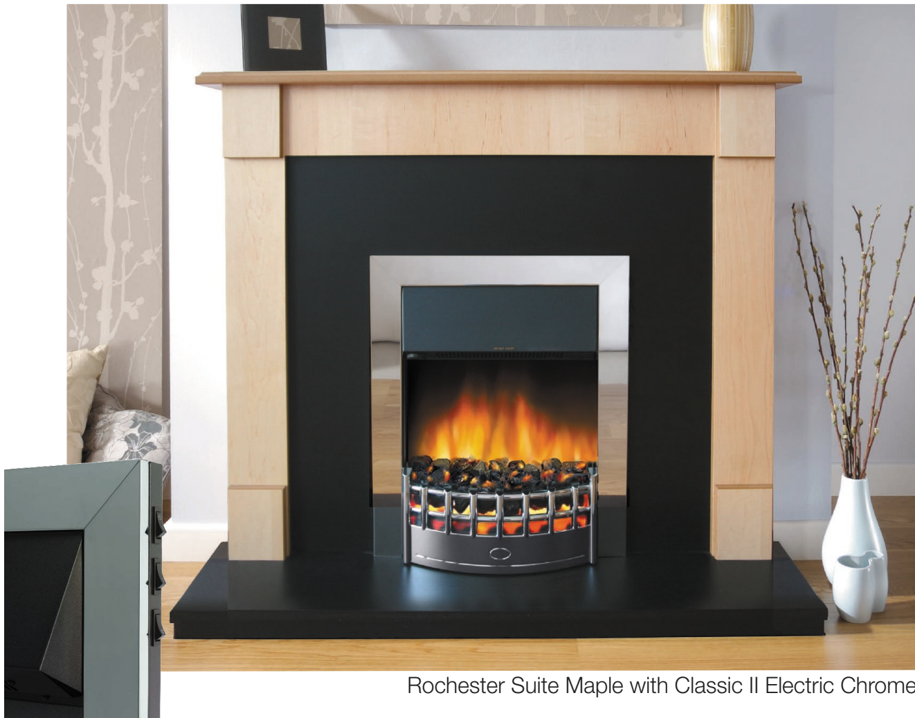
Rochester Suite Maple with Classic II Electric Chrome