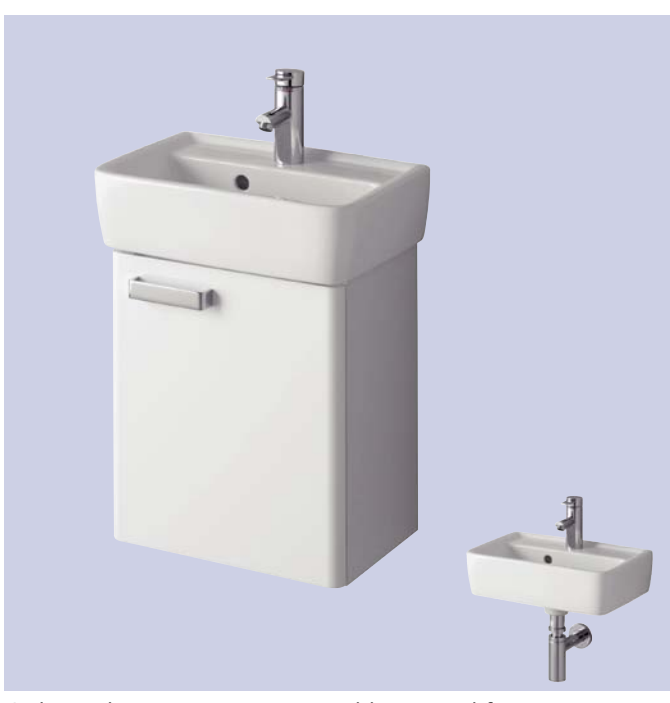
Galerie plan 450 x 320mm washbasin and furniture unit