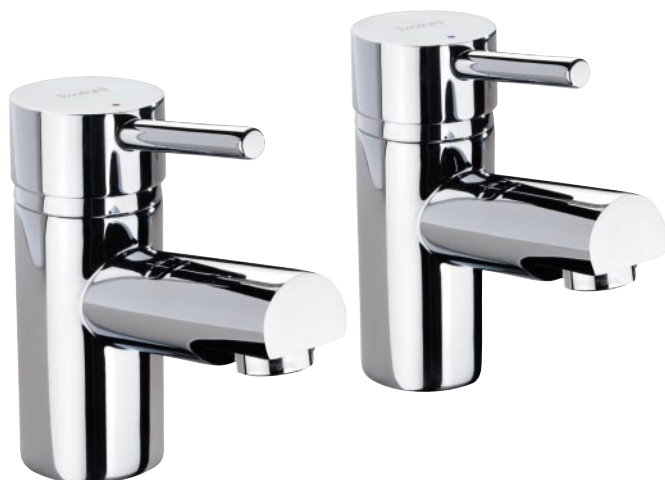
X60 Bath 3/4" Pillar Taps