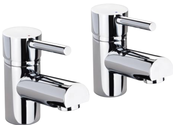
X60 Basin 1/2" Pillar Taps