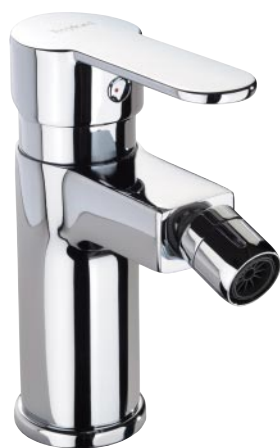
X50 Bidet Mono Mixer Inc Click Clack Waste