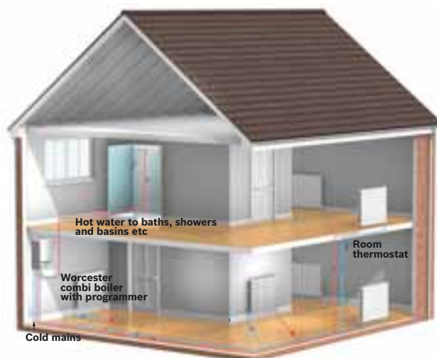
Combi boiler layout

Both a system boiler and a regular boiler work on the principle of stored hot water – but a system boiler is different in two important ways. Firstly, many of the components of the heating and hot water system are built into the boiler itself, making it quicker and easier to install. Secondly, it doesn't need a feed and expansion vessel in the loft. There are two kinds of cylinder which this type of system may have – a mains pressure hot water cylinder or a low pressure hot water cylinder. They are also compatible with solar water heating systems to bring you the added benefits of environmentally friendly hot water and reduced hot water and heating costs.