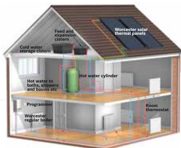
Regular boiler layout and solar water heating system