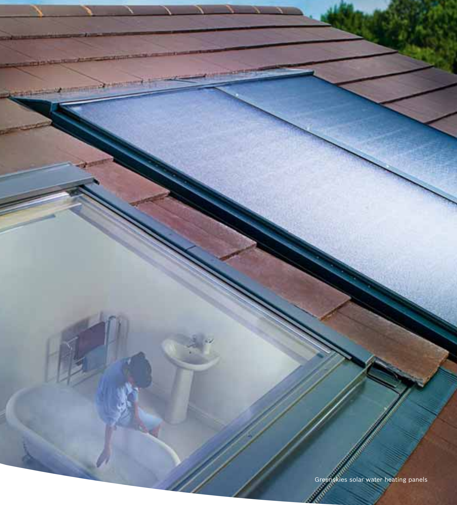
Greenskies solar water heating panels