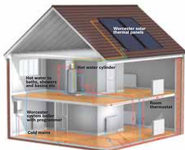
System boiler layout and solar water heating system (System boiler with unvented hot water cylinder)

Drawings are for illustrative purposes only