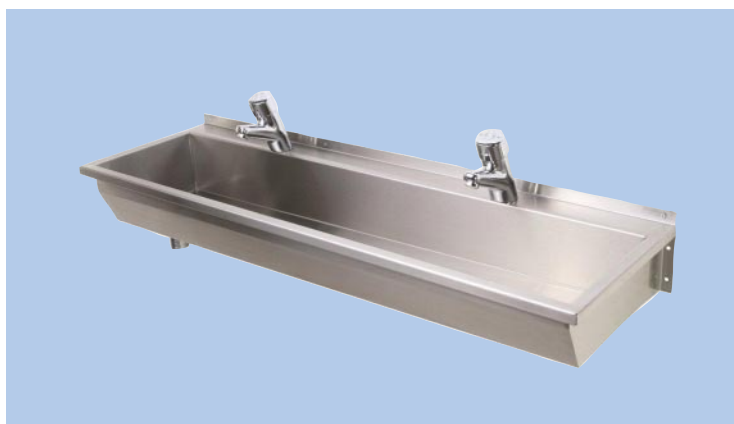
Washing trough, 2 person, 2 tap holes