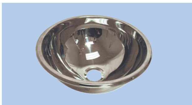
Inset washbowl 360mm

ideal for use with vanity units easy to clean