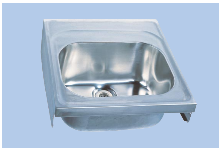
Hospital sink with single bowl, no tap holes

radiused easy clean internal surfaces underside sound deadened