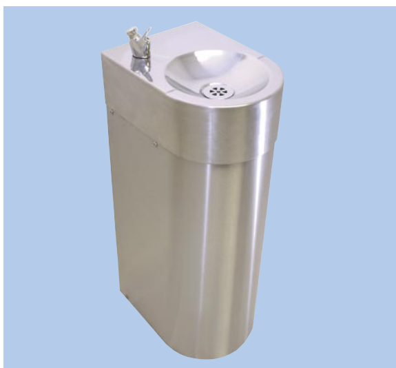
Drinking fountain - floor mounted (junior illustrated)

ideal for schools and colleges pedestal mounted, complete with push button water bubbler tap with protected nozzle, to minimise direct contact, it is WRAS approved