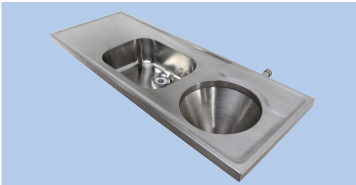
Disposal hopper, sink and worktop BI (LH drainer illustrated)

ducted or exposed cistern combined slop hopper, sink and drainer which conforms to HTM64 (DU-HS)