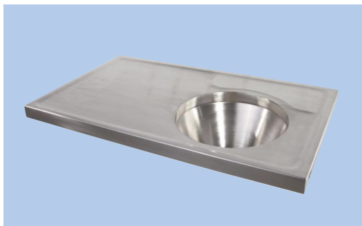
Disposal hopper with worktop BI (LH drainer illustrated)

ducted or exposed cistern solid and liquid waste disposal unit DU-H with continuous flushing rim and drainer