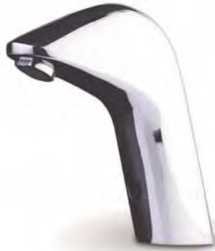
Infra red monobloc