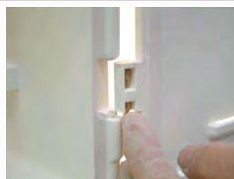
Push the sprung part of the brass pin in and hold, move the pin over the hole