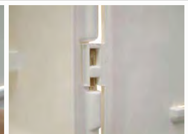
Release the brass pin allowing the sprung part of the pin to slot into the hole