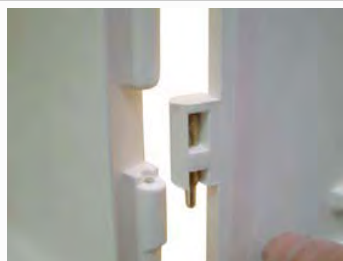
With the fixed pin fitted into the box, position the sprung pin over the other hole in the meter box