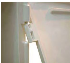
Push the steel fixed pin into the hole in the meter box