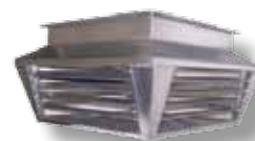
4 way diffuser box