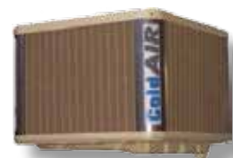
Roof top model RA