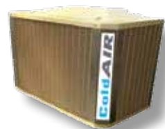
Wall / window model WA