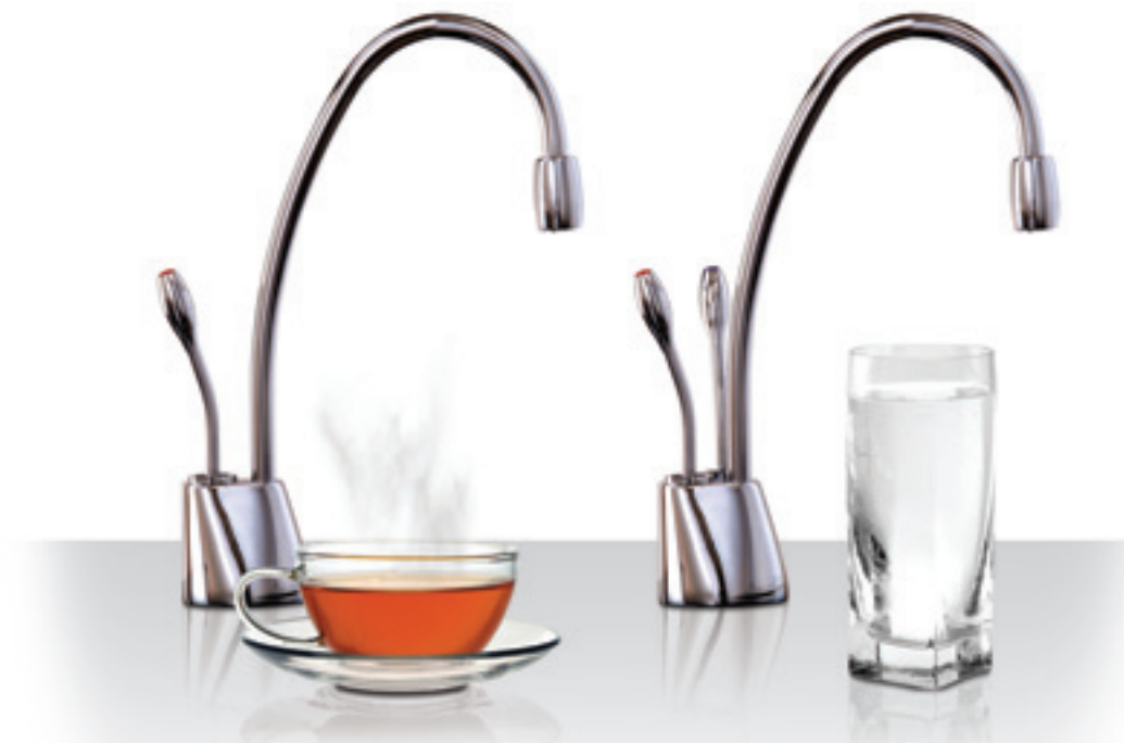
Both models available in brushed steel