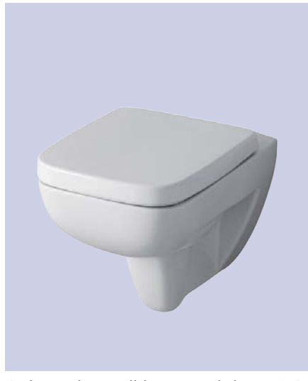
Galerie plan wall hung washdown WC suite, horizontal outlet

co-ordinating galerie plan range modern square design complete with fixings