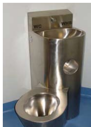
In cell sanitation unit with touch free water controls in Dublin Courts Building.