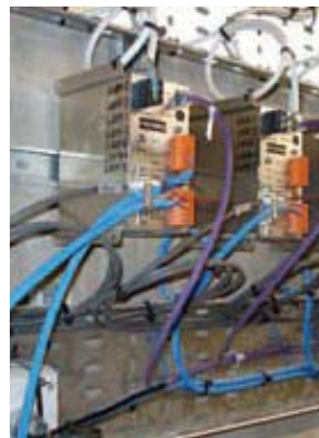
Central ECC control units for the AQUA3000 Open Water Management System