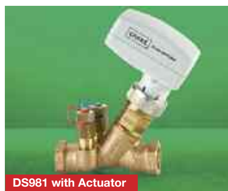
DS981 with Actuator