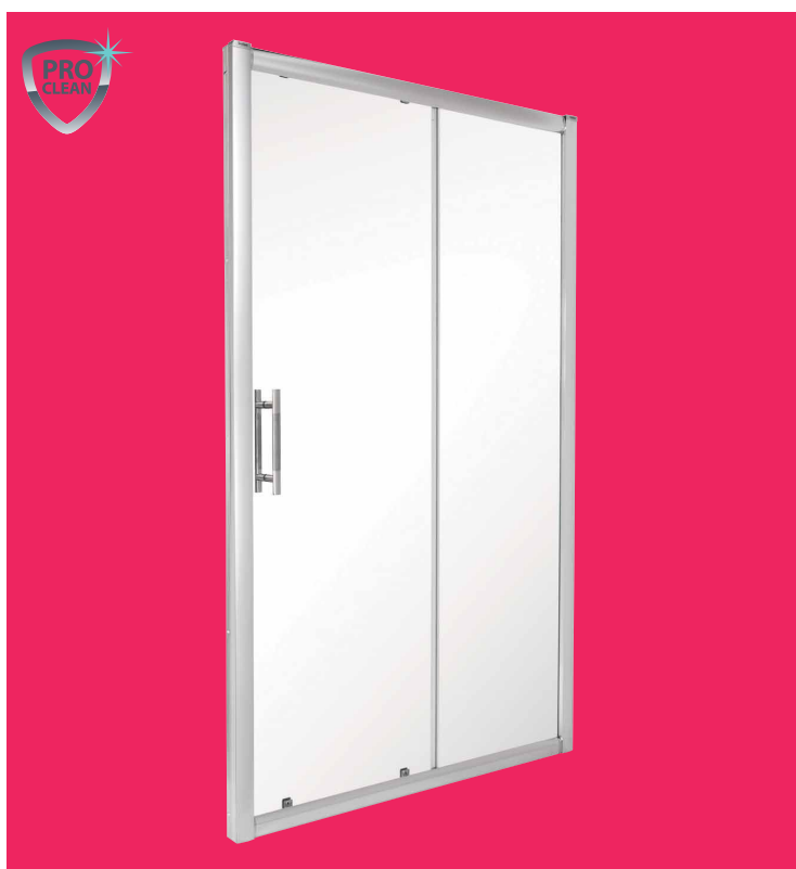
ES400 sliding door

6mm toughened safety glass with protective coating for easy cleaning click lock mechanism for quick assembly of horizontal profiles quick adjusting wall profile mechanism for speed and ease