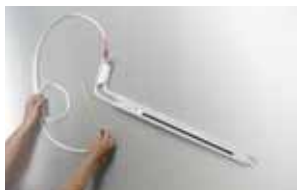
Model 1227 mounted in incline position.

Most versatile and useful low cost manometer we know of. Designed for installation and servicemen. A sturdy, clear plastic manometer, it offers single, direct readings in two ranges: As a U-tube, it reads from 0 to 16" of water; as an inclined gage, it reads from -.20 to 0 to 2.6" of water. Model 1227M (Metric) is 0 – 400mm water column as a U-tube and -5 to 0 to 70mm water column as an inclined gage. "How-to-use" instructions are printed directly on the scale.