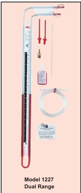
Model 1227 Dual Range