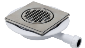
Tiled Floor Gully